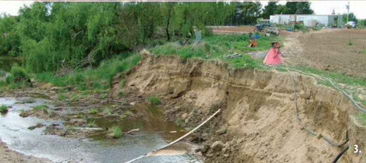
Photo captions: 1 & 2. Healthy riparian vegetation. 3. Degraded riverbank – no riparian vegetation. 4. Snags in the Murray River. 5. Excavator operator on riverbank doing unauthorised work. 6. Cows in the Shoalhaven River. 7. Pugging along the Lachlan River. 8. Bank erosion on the Murrah River.