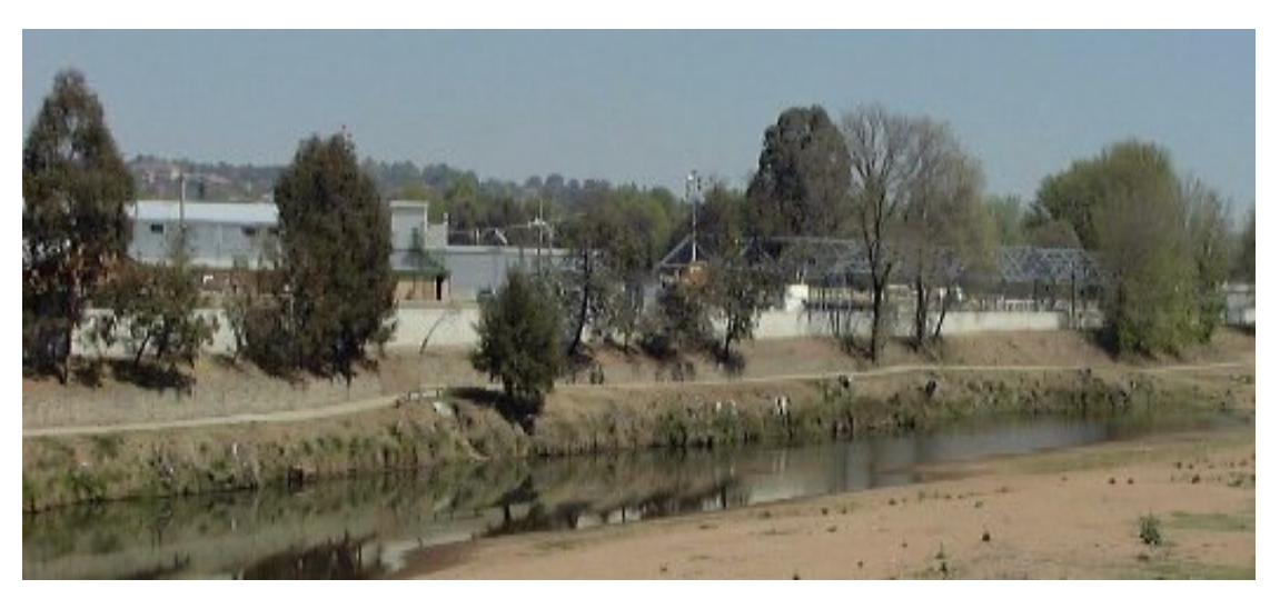
Levee wall adjacent to showground with Macquarie River in view