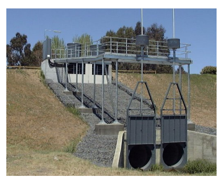
Old Vale Creek stormwater outfall penstocks and flood pumps