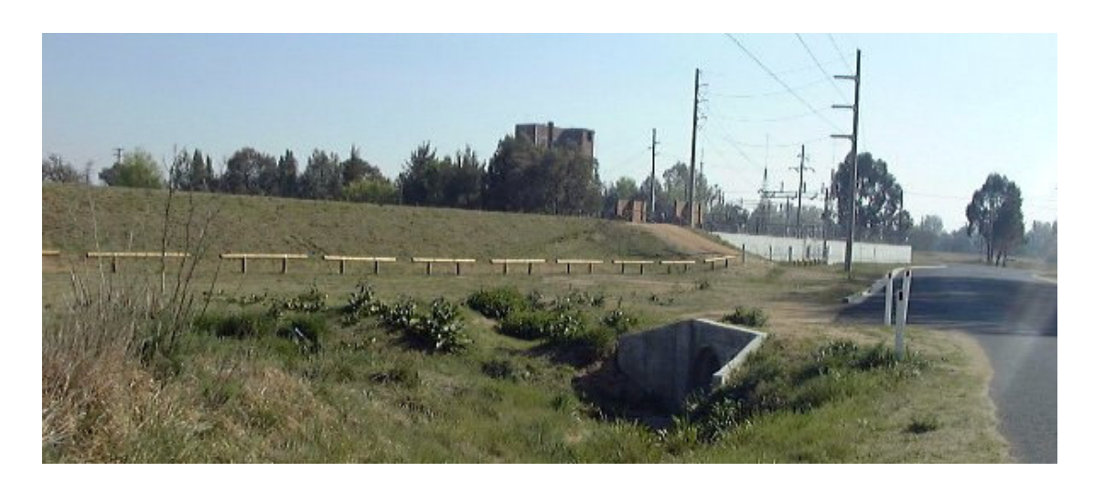
Russell Street underpass protection includes concrete levee wall to electrical substation