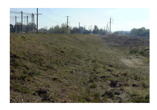
Acheron Street closed and reclaimed on levee alignment