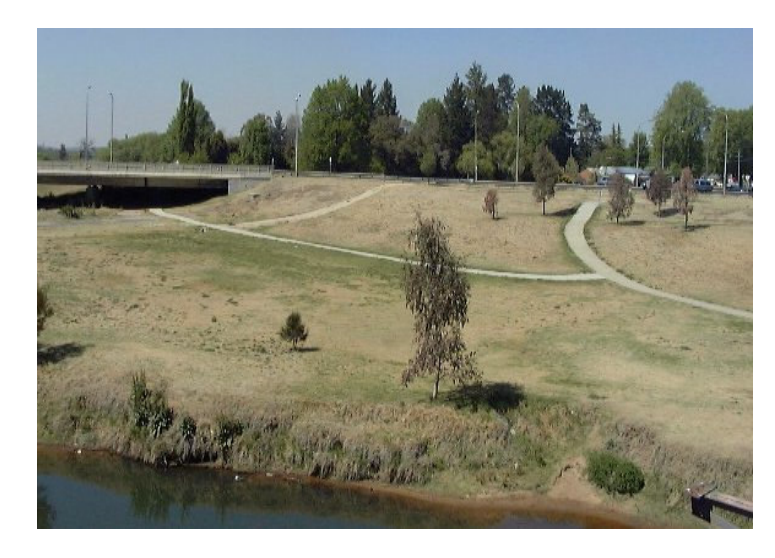
Levee constructed downstream of Evans Bridge and adjacent to Cousins Park