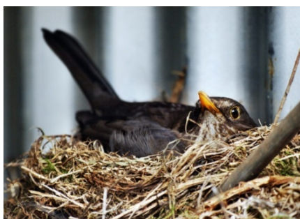
Blackbird in nest

For further information see 'Pest Birds - Potential Control Options' fact sheet