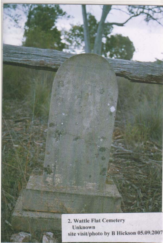
Wattle Flat images Page 3