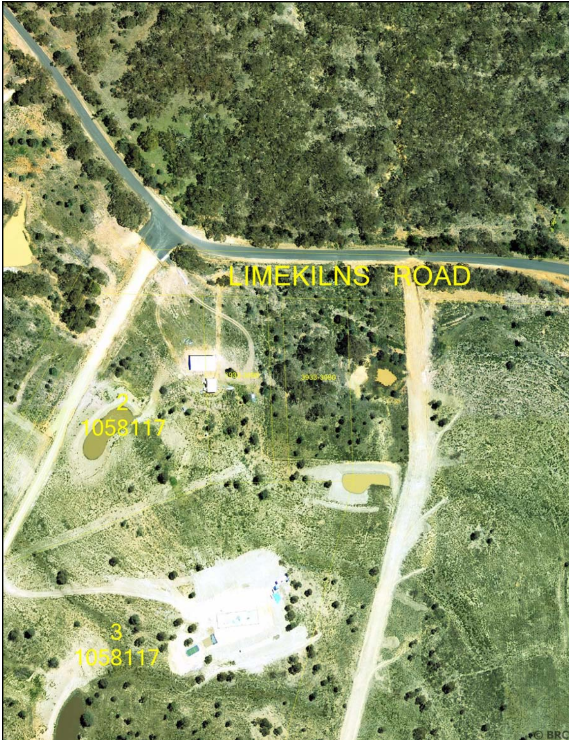
Figure 5: The cemetery is located in the bushland to the south of Limekilns Road.