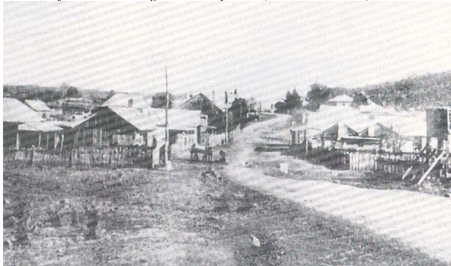
Figure 7: Street scene, at Wattle Flat 1904. (p.301, Cook & Garvey: