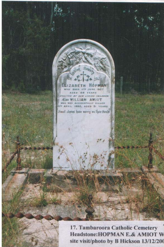
17. Tambaroora Catholic Cemetery Headstone:HOPMAN E.& AMIOT W site visit 13/12/200