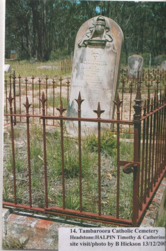
14. Tambaroora Catholic Cemetery Headstone:HALPIN Timothy & Catherine site visit 13/12/200