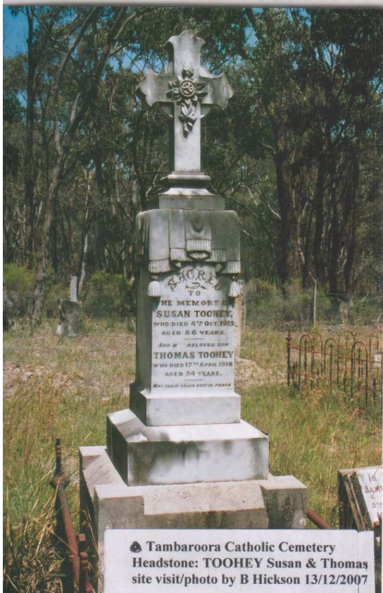
Tambaroora Catholic Cemetery Headstone: TOOHEY Susan & Thomas site visit 13/12/2007