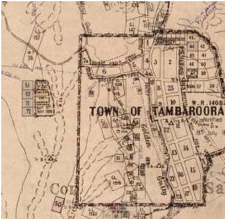
Figure 3: Part of the Tambaroora Parish Map showing a general cemetery notified on 9 th February 1898. The town limits are shown in red on the right hand side. In this plan the cemetery is called the 'general cemetery' which later became known as the Catholic cemetery.

The cemetery known today as the Tambaroora General Cemetery was originally set aside for the Church of England school, church and parsonage in 1863, but later was rededicated as the general cemetery.