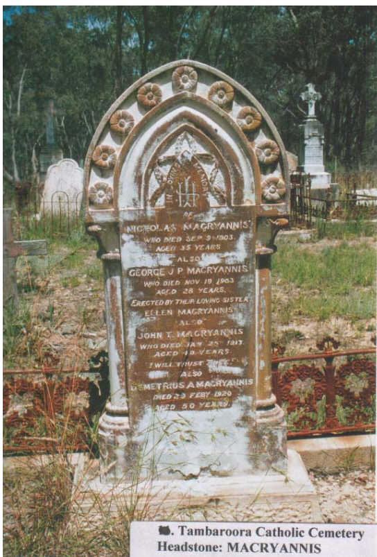
Tambaroora Catholic Cemetery Headstone: MACRYANNIS site visit/photo by B Hickson 13/12/2007