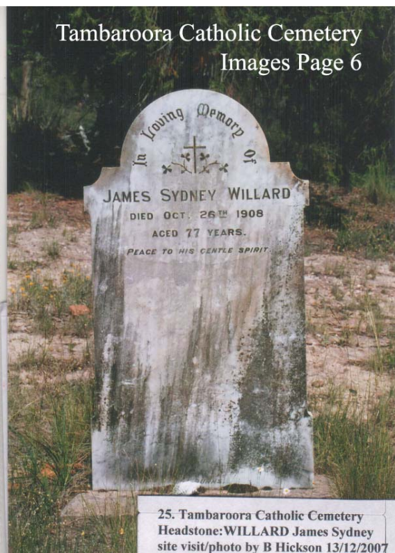
25. Tambaroora Catholic Cemetery Headstone: WILLARD James Sydney site visit/photo by B Hickson 13/12/2007