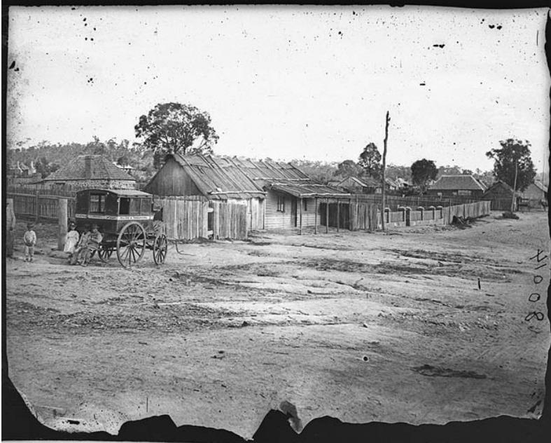
Figure 14: Tambaroora horse drawn omnibus, Tambaroora.