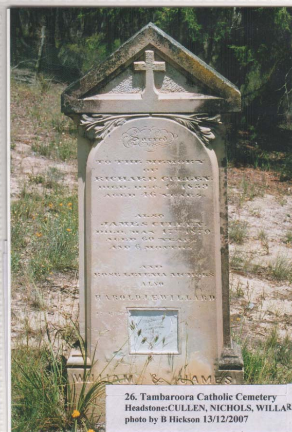
26. Tambaroora Catholic Cemetery Headstone: CULLEN, NICHOLS, WILLARD 13/12/2007