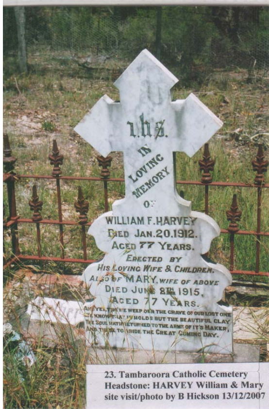
23. Tambaroora Catholic Cemetery Headstone: HARVEY William & Mary site visit 13/12/2007