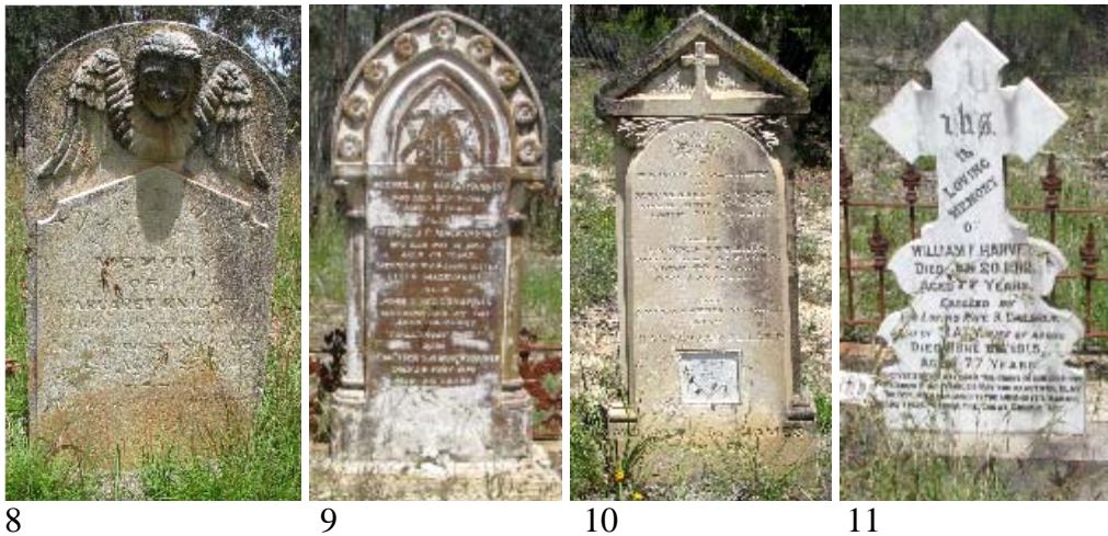
Figure 8: Margaret Knight: semicircular sandstone stele with outstandingly crafted angel at the apex.

Many memorials are exceptional as identified in the Figures below.