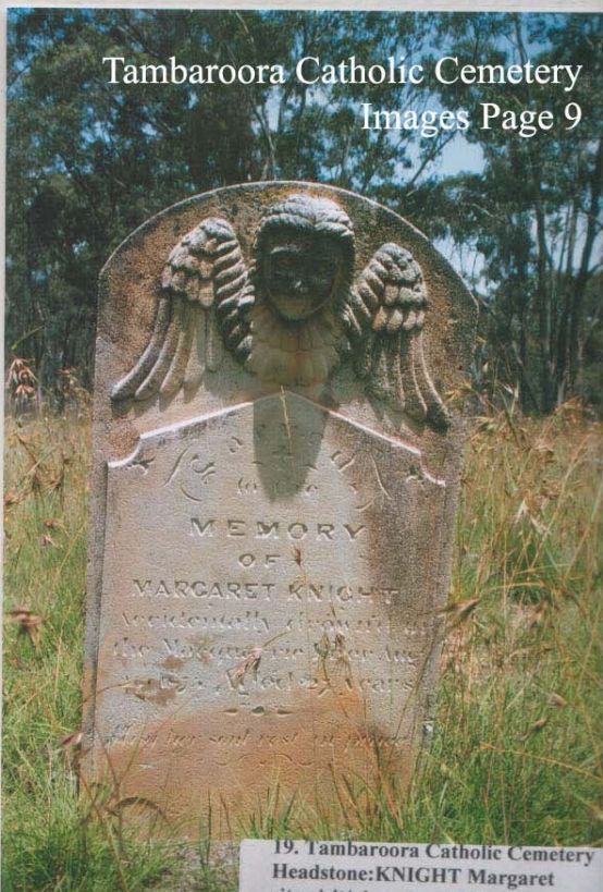
19. Tambaroora Catholic Cemetery Headstone:KNIGHT Margaret site visit 13/12/2007

Tambaroora Catholic Cemetery Images Page 9