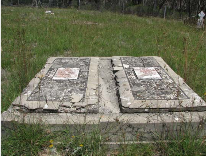
Figure 12: Unusual reclining bed monuments to members of the Mullins family.