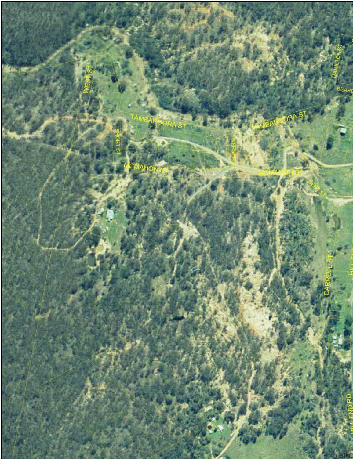
Figure 6: The above aerial image was provided by Bathurst Regional Council. The cemetery is located in the square at the centre of the image near a triangular shaped clearing.