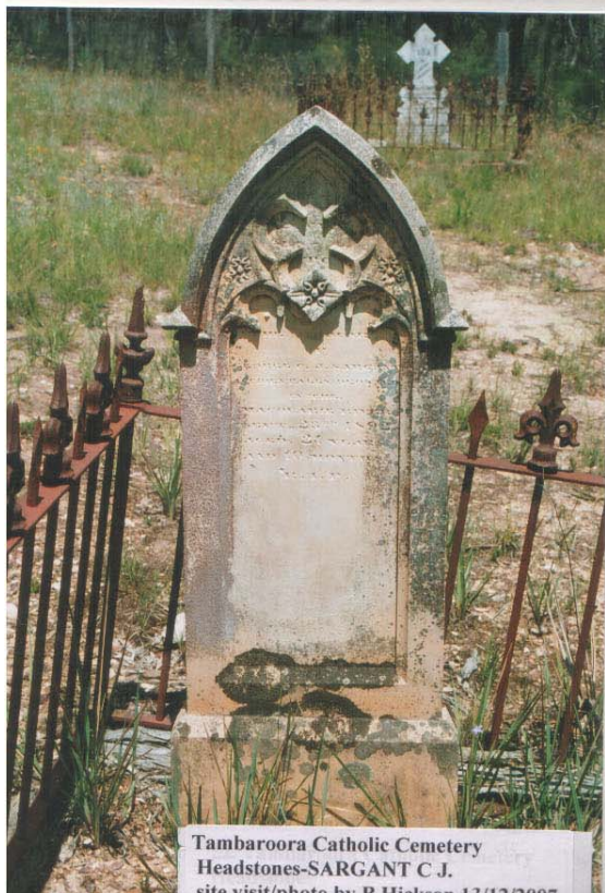
Tambaroora Catholic Cemetery Headstones-SARGANT C.J. site visit/photo by B Hickson 13/12/2007