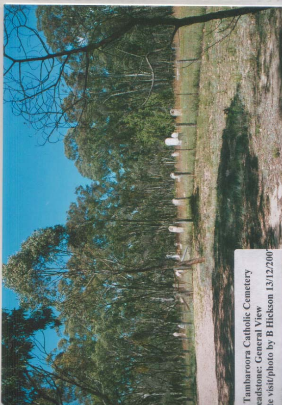
10. Tambaroora Catholic Cemetery Headstone: General View site visit 13/12/2007