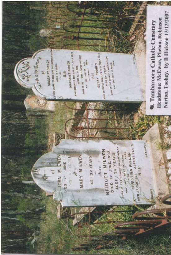
7. Tambaroora Catholic Cemetery Headstone: McEwan, Phelan, Robinson Norton, Toohy, by B Hickson 13/12/2007