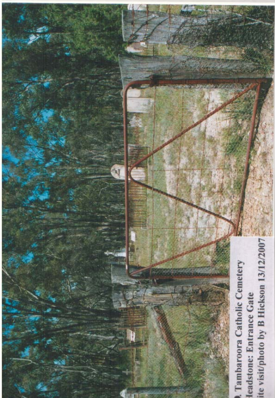
9. Tambaroora Catholic Cemetery Headstone: Entrance Gate site visit 13/12/2007