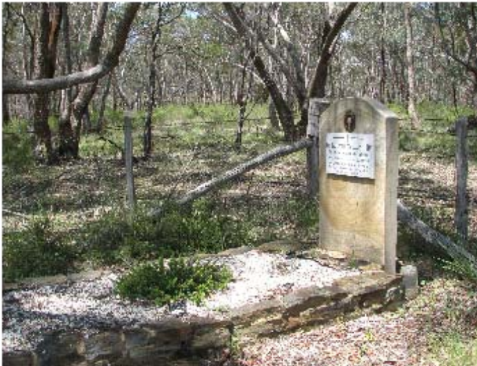
Figure 5: A grave located in the corner of the fenced section of the cemetery.

The gate of the cemetery is located on the east side, and the grave stones face east.