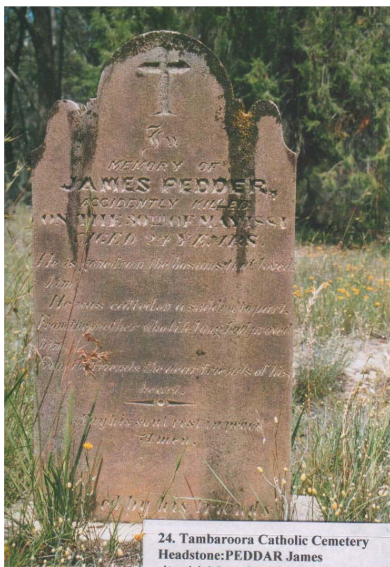
24. Tambaroora Catholic Cemetery Headstone: PEDDAR James site visit 13/12/2007