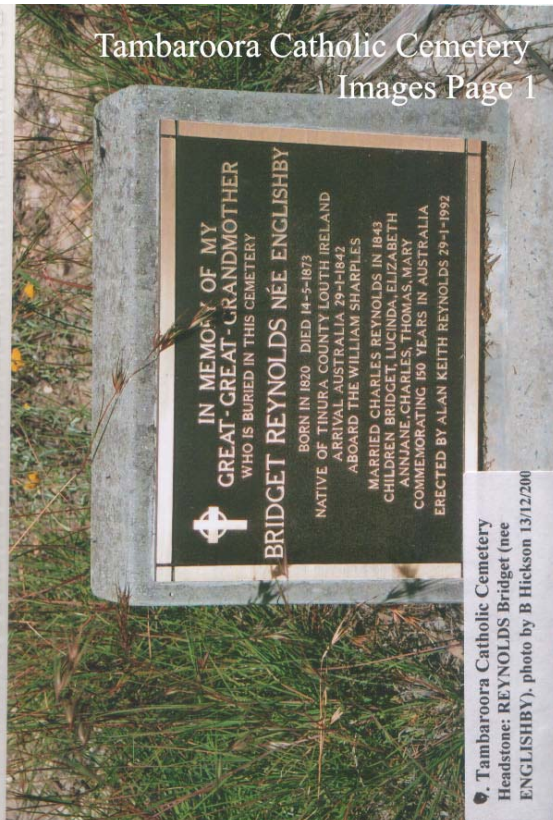
8. Tambaroora Catholic Cemetery Headstone: REYNOLDS Bridget (nee ENGLISHBY), photo by B Hickson 13/12/2007