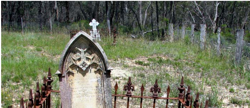
Figure 7: The boundary fence of the cemetery is visible in the background of this image.

Generally the fence appears to be fairly well maintained.