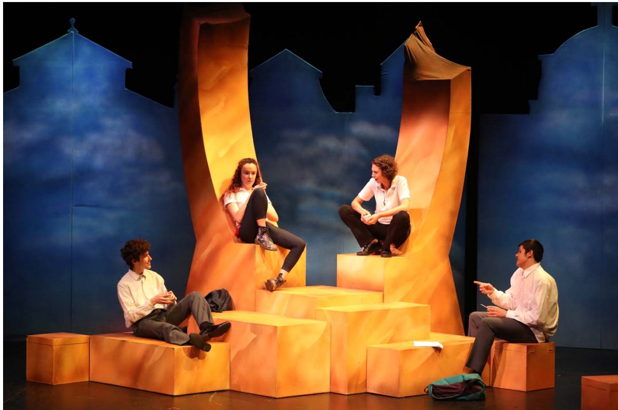
Image - Cast members on the set of The Climbing Tree

The Climbing Tree is playing a far-too-limited season at Riverside Theatres in Parramatta, so you'd better be quick in getting out to this part of Sydney to see it before the 24th November. It's a truly unique and inherently Australian look at the fabric of our regional towns, the whitewashing of our places and our history and the challenges of growing up."