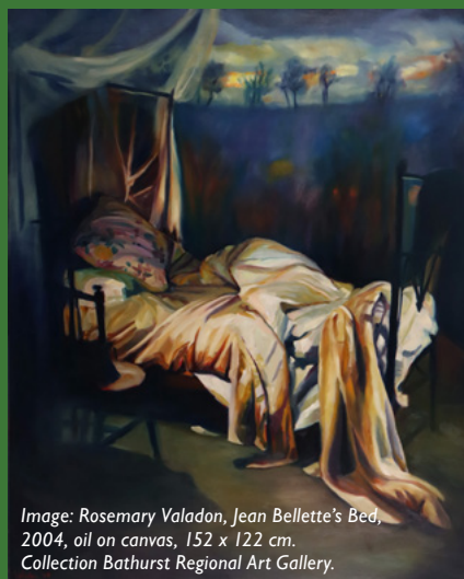
Image: Rosemary Valadon, Jean Bellette's Bed , 2004, oil on canvas, 152 x 122 cm. Collection Bathurst Regional Art Gallery.

This exhibition brings together works from Bathurst Regional Art Gallery's Collection that reflect the enduring artistic allure of Hill End. For over seventy years, this historic village has captured the imaginations of artists drawn to its layered histories, dramatic terrain, and evocative sense of place.