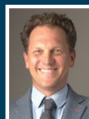
JESS JENNINGS MAYOR

Visit elections.nsw.gov.au/lge24 or call 1300 135 736