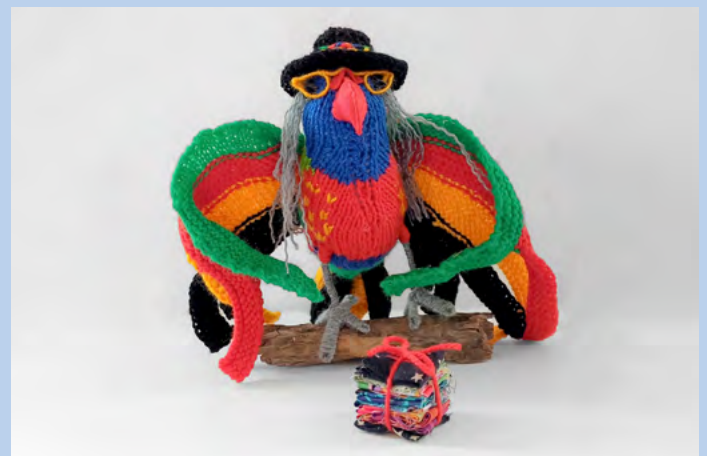
Leanne Wicks, Linda Jackson, 2023, yarn, wire, glass, felt, fabric, fill, 25 x 29 x 14 cm. Image courtesy the artist.

For more information visit www.bathurstart.com.au